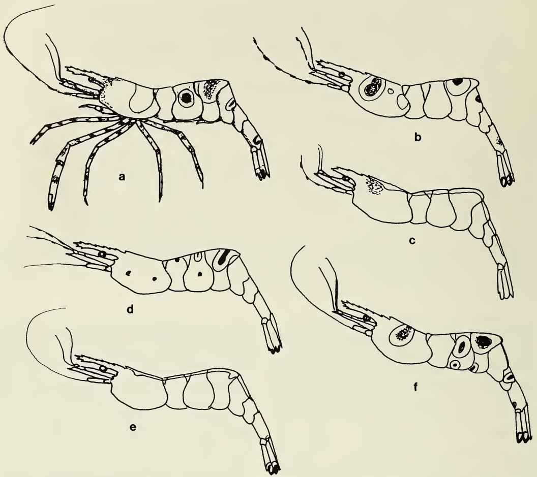
Fig. 2. Color variation in Periclimenes yucatanicus , drawn from photographs in life. a, entire animal, showing banded appendages, from Florida, day; b, individual from Bonaire, day; c, individual from Bonaire, night; d, individual from Bonaire, day; e, same individual as seen in drawing d, night; f, individual from Bonaire, day.

fan could not be observed in the photograph.